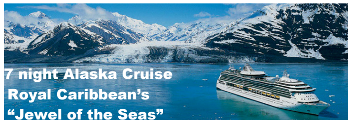
7 night Alaska Cruise Royal Caribbean's "Jewel of the Seas"